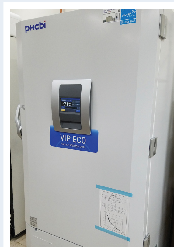
One of the ways we have prepared for supplying the COVID-19 vaccine is a special freezer that keeps the vaccine at the specific required temperature of - 71 degrees.

Our team is devoted to doing what is in the best interest of the patient. This is at the forefront of Hudson Regional Long Term Care Pharmacy's mission and heart.