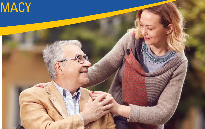
Hudson Regional LTC Pharmacy is Medicaid and Medicare (including Part B) approved and is accredited by the Joint Commission.

We recognize the importance of choosing the best fit when it comes to a long-term care pharmacy for your facility. We are dedicated to earning your patronage and helping you in taking the best care of your patients.